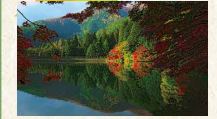
Lake Minami-Inagako 1/1 C-3