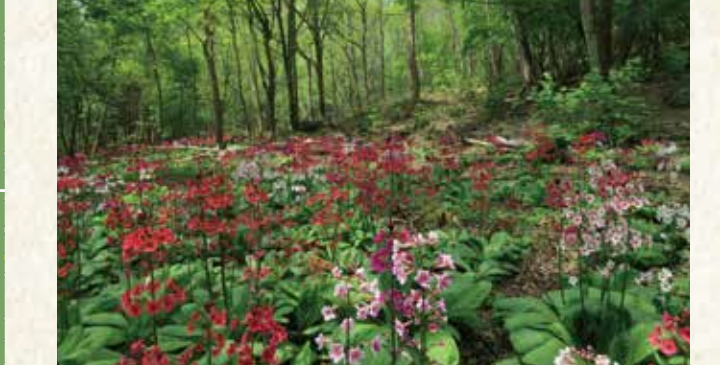
Seiradaira 1/1 B-1