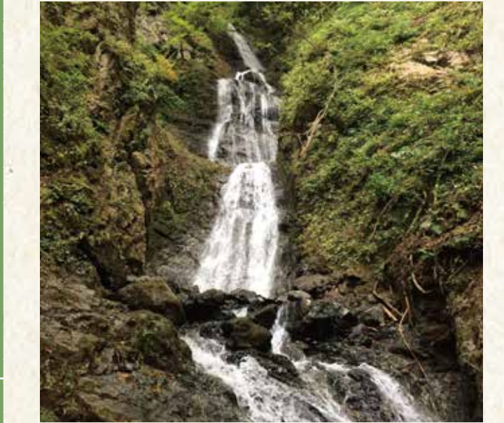
Seto Sendan Fall 1/1 B-2