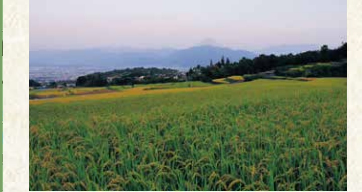
Nakano District rice terraces 1/1 C-3