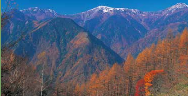
Yashajin Pass 1/1 A-2